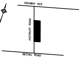
(KEY MAP - N.T.S.)