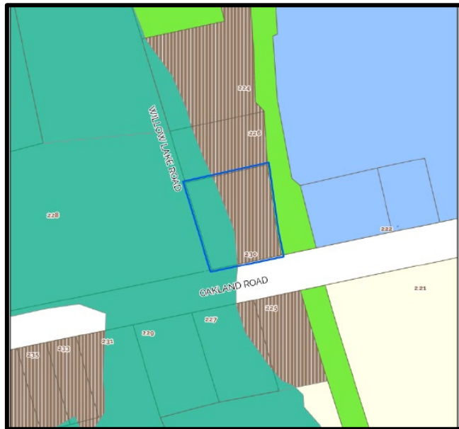
Land Use Designation: Natural Heritage System and Village Developed Area