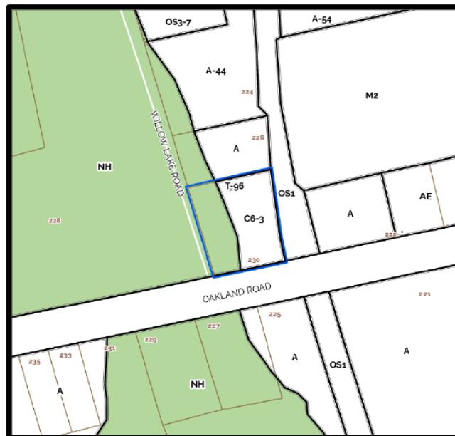
Zoning Classification: Special Exception Automotive Commercial (C6-3)