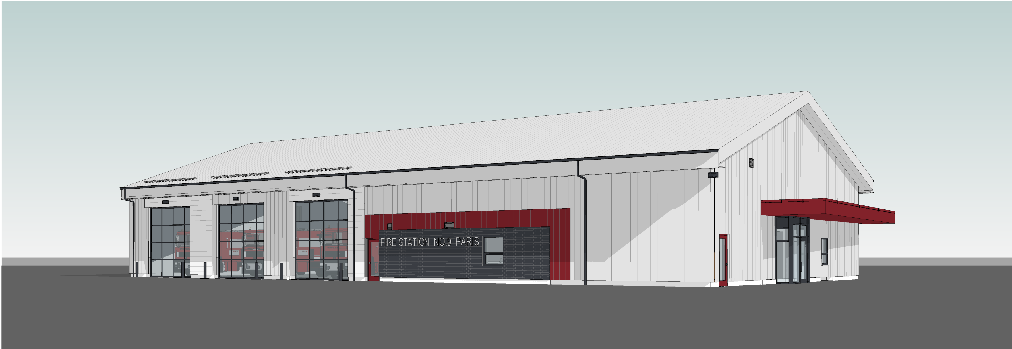
PERSPECTIVE FROM SCOTT AVE LOOKING NORTHWEST SCALE: N.T.S.