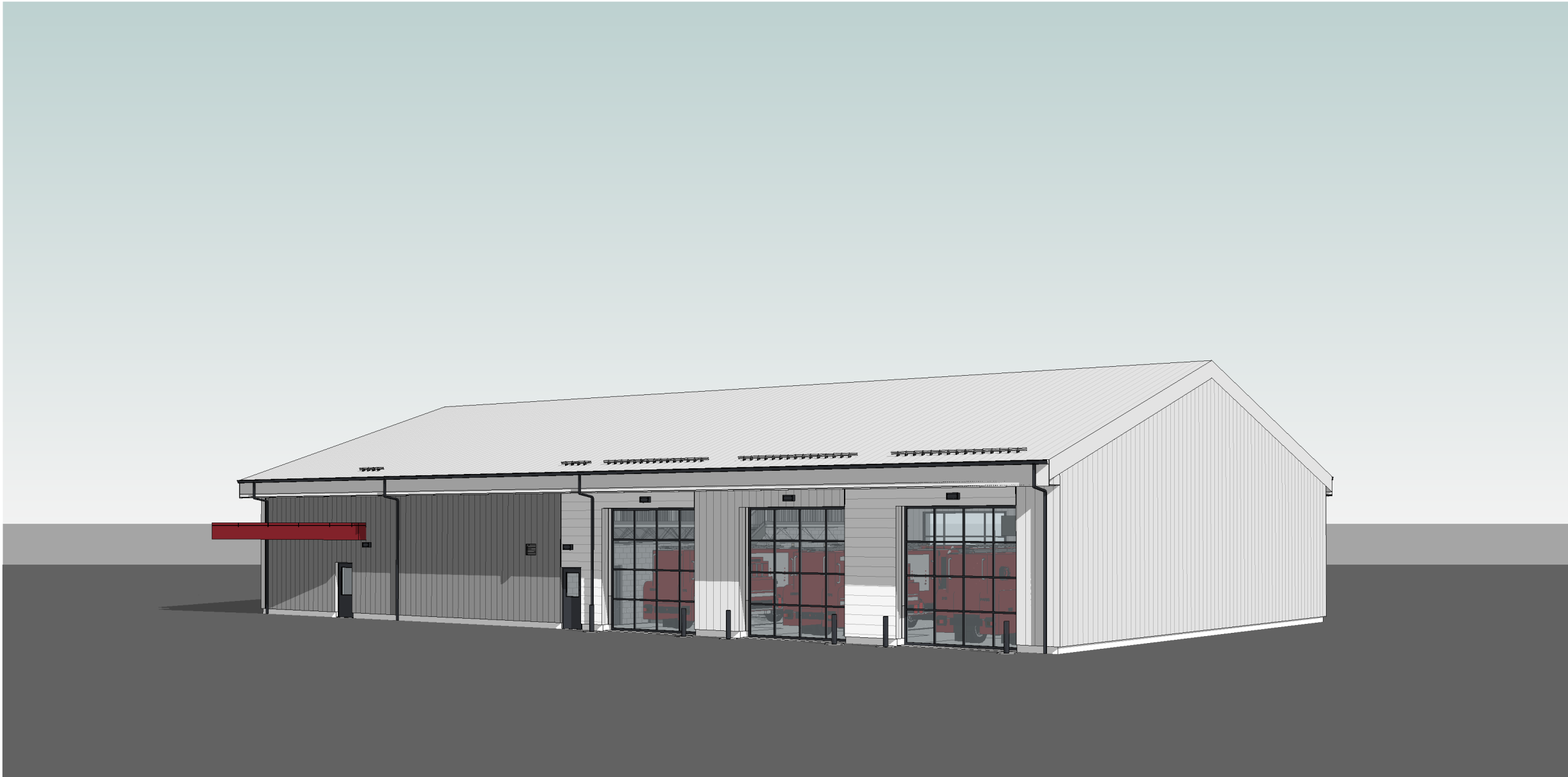
PERSPECTIVE FROM REAR LOOKING SOUTHEAST SCALE: N.T.S.