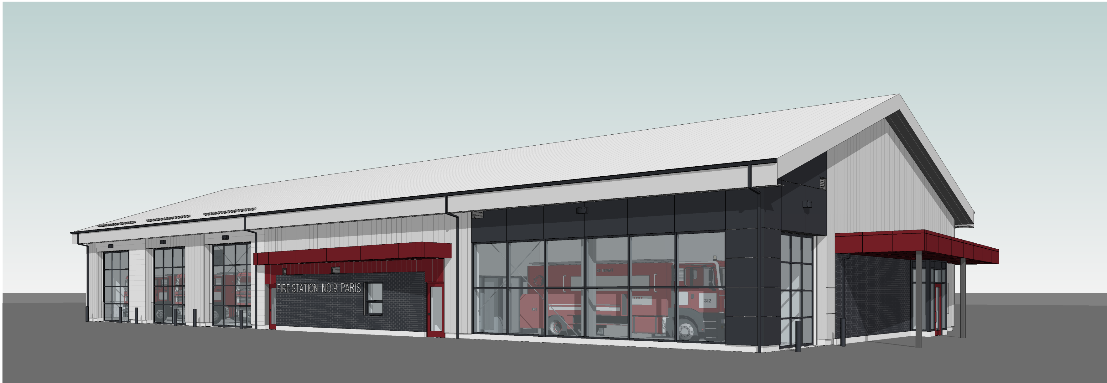
PERSPECTIVE FROM SCOTT AVE LOOKING NORTHWEST SCALE: N.T.S.