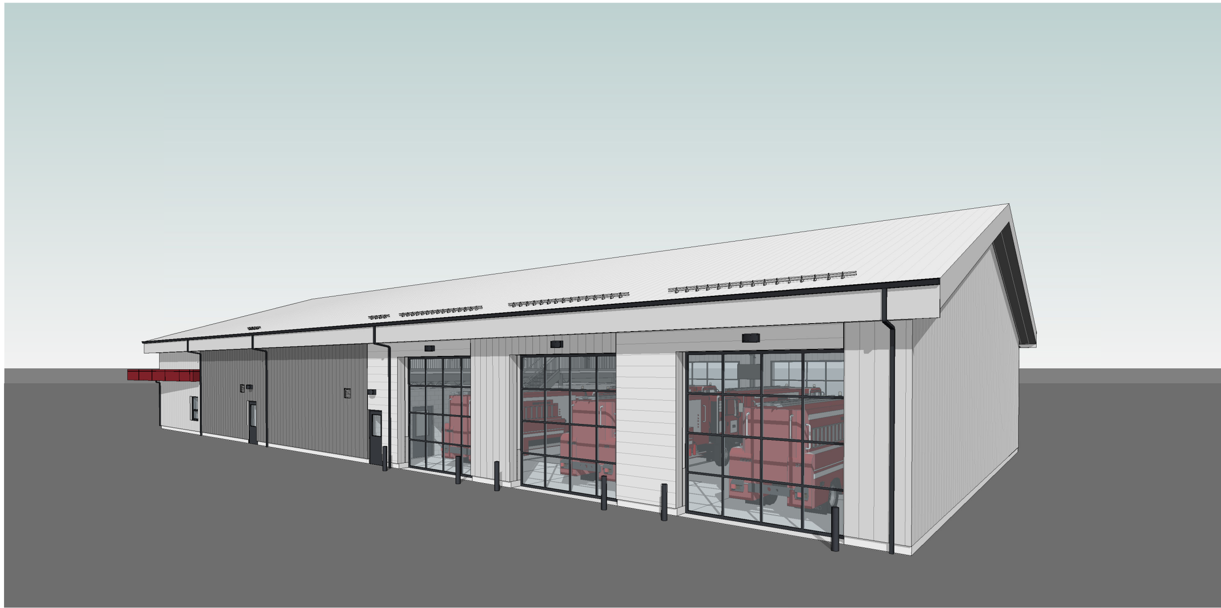
PERSPECTIVE FROM REAR LOOKING SOUTHEAST SCALE: N.T.S.