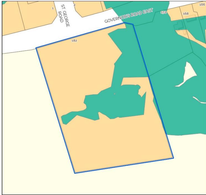
Land Use Designation: Countryside and Natural Heritage