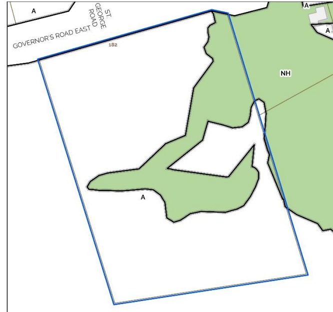
Current Zoning: Agricultural (A) and Natural Heritage (NH)