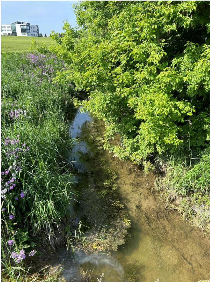
Simmons-Hopkins Municipal Drain Looking upstream from 9 th Concession Road

Realign approximately 320m of the Simmons-Hopkins Municipal Drain on the Stubbes Precast Commercial Property