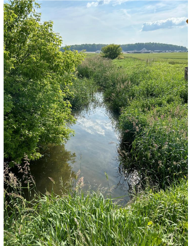
Simmons-Hopkins Municipal Drain Looking downstream from Muir Road