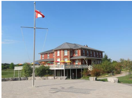
Tim Hortons Onondaga Farms