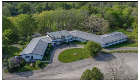
Five Oaks Retreat