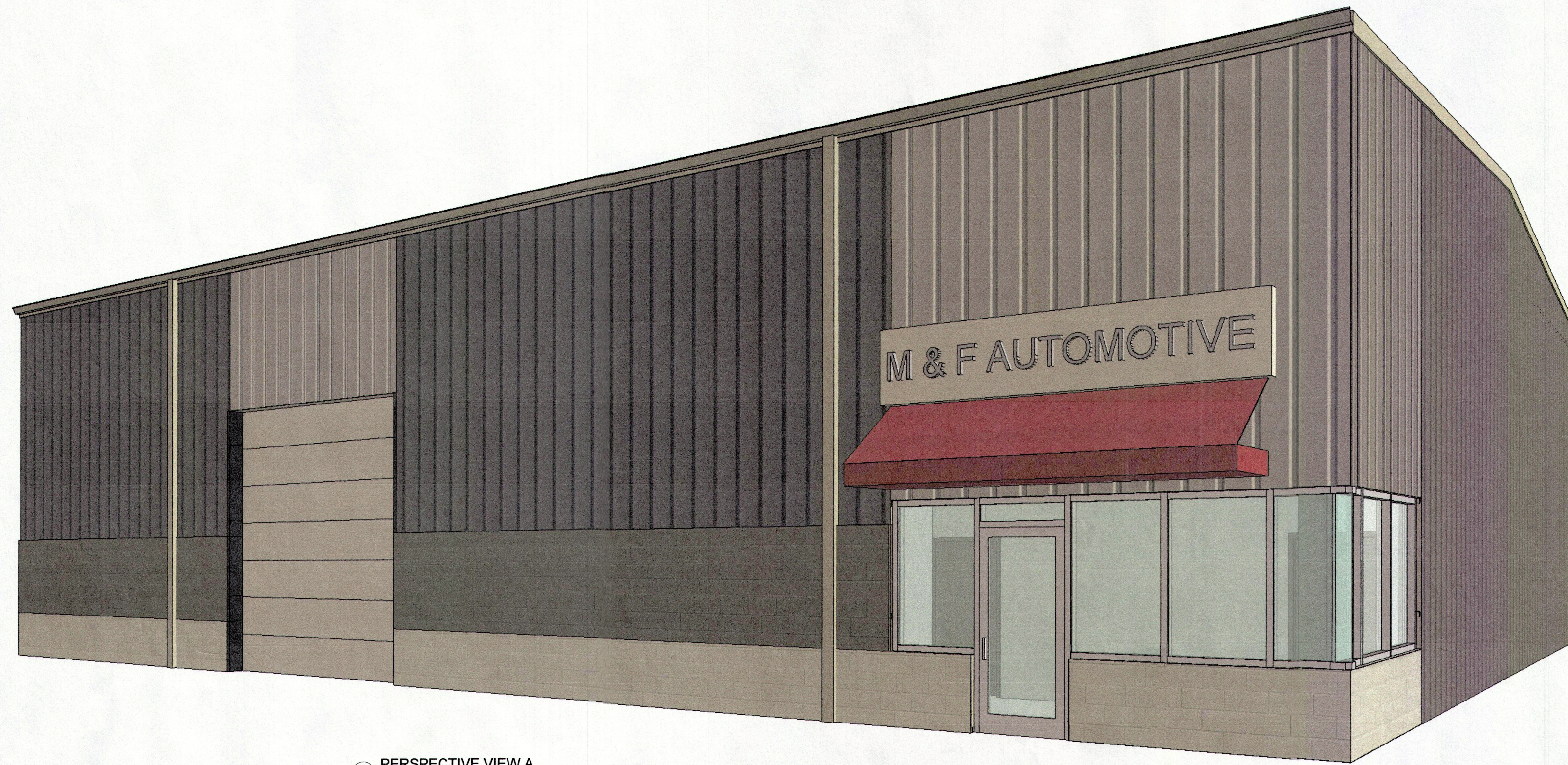
① PERSPECTIVE VIEW A