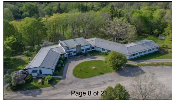
Five Oaks Retreat