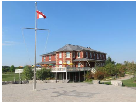
Tim Hortons Onondaga Farms